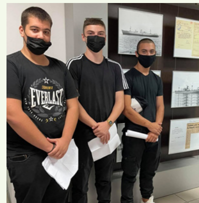
The interviewers.

They also had the chance to visit art exhibitions, and watch short films on the sea and shipping. This event gave citizens the opportunity to get an insight to the maritime activities of Cyprus, from a cultural, financial, educational and an environmental aspect. Your school, A' Technical and Vocational School of Limassol was there with you, the students and a team of teachers to help promote the school and the school's activities concerning maritime and it was done with a great success. We appreciate your presence and your assistance and I am sure your maritime future will be bright.