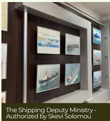
The Shipping Deputy Ministry - Authorized by Skevi Solomou

One can definitely observe that we are very careful in the use of materials. Even in the use of materials, for example, in the way we serve today in our ships, we do not use any plastic utensils, cutlery or cups. This is one way in which we promote within the state secretary some things related to this issue. At the same time, and as a Deputy Ministry, we support innovative ideas that seek research. A very good example to give you, is what we are doing right now.