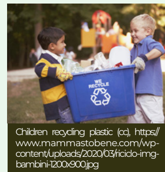
Children recycling plastic