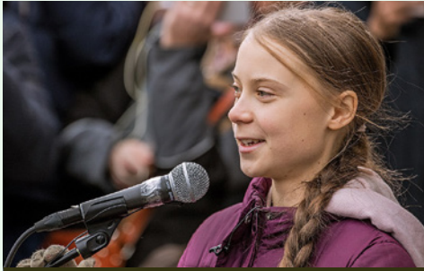
Greta Thunberg

“You are right, Greta is a great example of all of us. Another question: what would you do to improve recycling at school?”