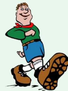
Boy scout, pixabay license, https://pixabay.com/it/vectors/boy-scout-escursionismo-camminare-311682/