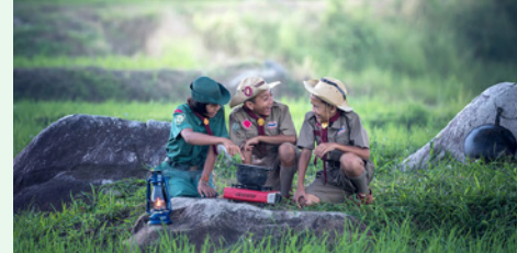
Boy scout

One of my favourite idea I found on the internet is the search engine “Ecosia” that uses the ad revenue from your searches to plant trees where they are needed the most. It is an original option to use instead of other search engines to give the possibility to everyone and every time to do their concept to the environment.”