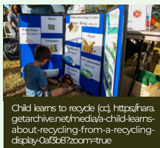
Child learns to recycle (cc), https://nara.getarchive.net/media/a-child-learns-about-recycling-from-a-recycling-display-Caf3b8?zoom=true

“Furthermore, the scouts educate the children and the teenagers to recycle and reuse what is to be transformed into waste: last year, a group of boys built a sofa and an armchair with plastic bottles; some girls built bookshelves with the wood fruits’ boxes; this year some guys built a raft with plastic bottles and someone else with the recycled wood. We have done a lot of activities about recycling and we still do them also at home.”