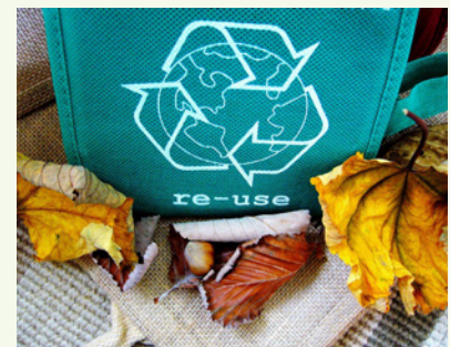
Recycle and reuse

There are hundreds of ways on how to reuse materials, it goes as far as the human imagination. Reusing can be initiated by a lot of different reasons such as saving money, fun, exploring your abilities and much more. Basically, working as a bartender during corona is not financially sustainable so that made me realise the importance of saving money. Having a lot of free time and a need for money got me using shopping bags more than once because it's cheaper and it's better for preserving nature.