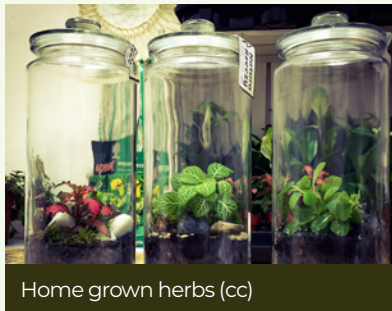
Home grown herbs (cc)

Do you think that the circular economy principles will change the current economic, social and environmental model? Join our poll and share your opinion. “