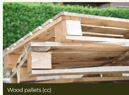
Wood pallets (cc)

For example, we can use textile bags instead of plastic ones or old metal cans and plant flowers or herbs in them. As a matter of fact, I made a pencil case for my niece from an old plastic bottle. Any kind of preserving is great for nature, but I would say probably the best one would be reusing as it does not need a lot of material and spending because the old and already used is needed.