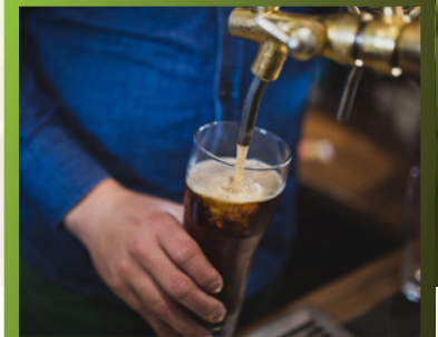
Pouring beer (cc)