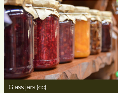
Glass jars (cc)

Making your own furniture is much more fun and it gives off a more natural look to your garden and it is very much nature preserving. Except furniture I also like to buy clothing in second-hand shops as in that way I reuse old clothing and it doesn't go to waste. I also buy books that are reused or are pressed on reused paper as that gives me the opportunity to have a physical book in my hands but more cheaper and better for nature.