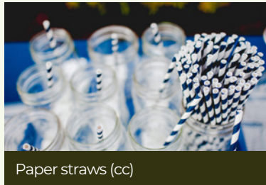
Paper straws

It is not all about money, on the contrary, it is about doing something for the environment and the world that we are all a part of. Additionally, there is not a valid reason not to reuse as it teaches us what really matters and not to mention that it has a great impact on our life and our creativity. It is also fun and a great time spending idea. I think reusing really helped me in ways such as living a healthier life not just financially but also nature beneficially.