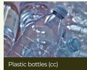
Plastic bottles (cc)

Some examples of reusing coffee waste would be composting coffee grounds in your garden, using coffee grounds as fertilizers, feeding plants nutrients (plants that like acidic soil, such as azaleas, can particularly benefit from used coffee), deterring pests, skincare, exfoliating (for a natural body scrub that leaves your skin smooth, soft, and slightly fragrant, try using used coffee grounds), cooking (coffee can enhance the flavours in chocolate cakes and brownies, too) and many more. Most of those tricks that involve reusing and recycling I learned from my boss and co-workers to which I am very thankful because they make my way of living this life much more interesting and in a tip-top condition.