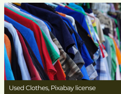
Used Clothes