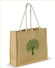
Cotton bag (cc)

This type of reuse is not only nature friendly but also interesting and a money-making idea. It can be done by everyone at home on their own and I think that's the best part of it. Additionally, I think this kind of Reuse makes people motivated to contribute a little more to the planet and circular economy. This also raises awareness of the importance of recycling, reusing and basically living a nature friendlier life.